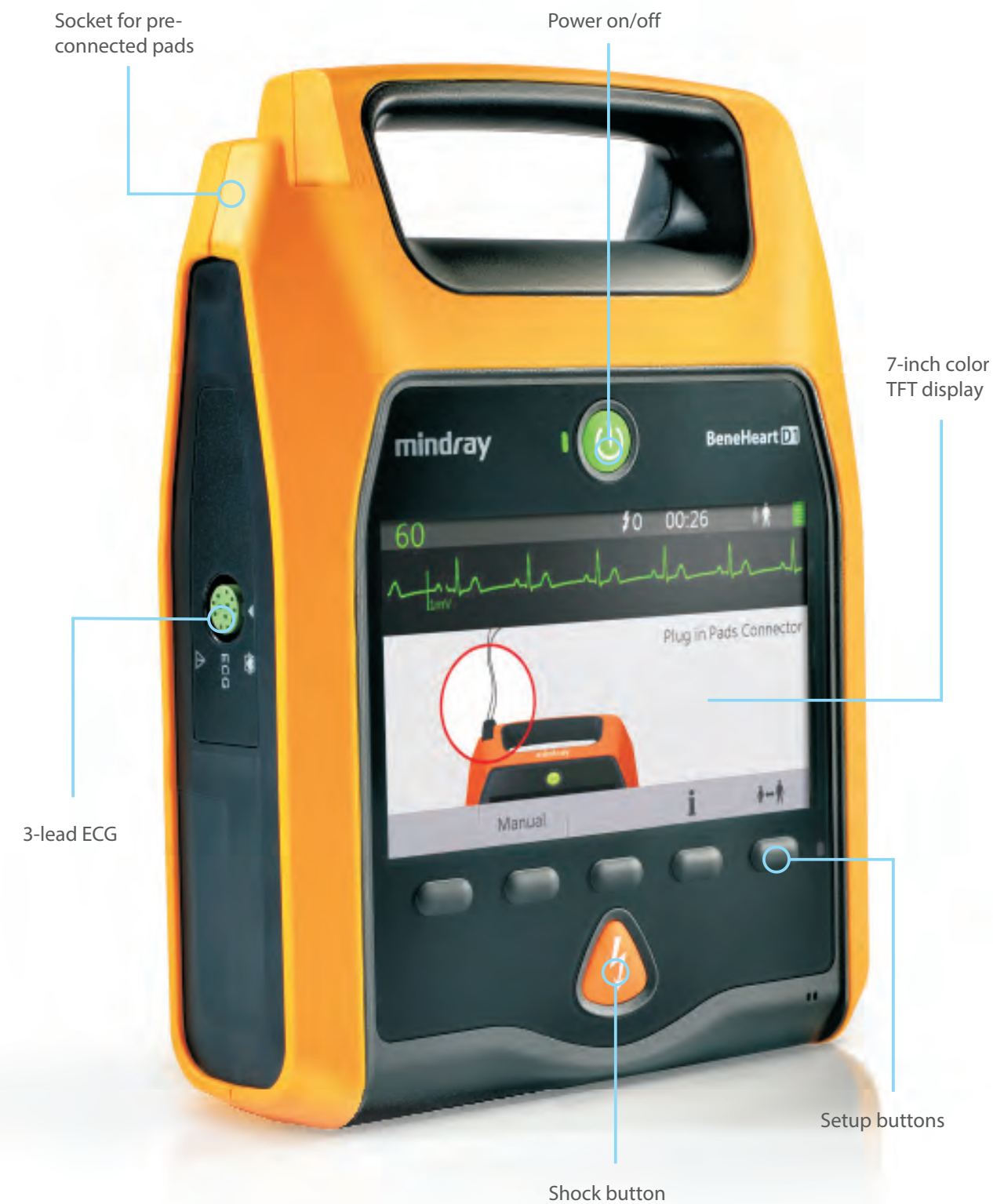
BeneHeart D1 has the high protection level (IP55) to against the dust and water.