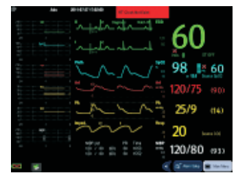
Mini-trend for easier trend analysis