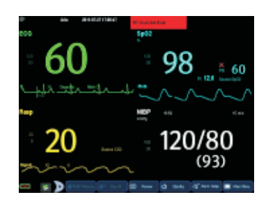
Large font and customized layout