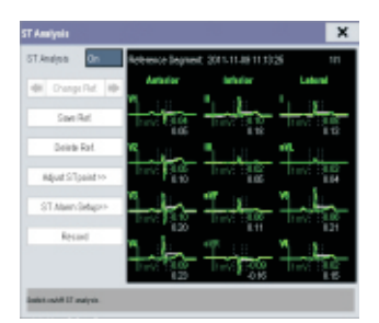
Up to 23 types of arrhythmia analysis